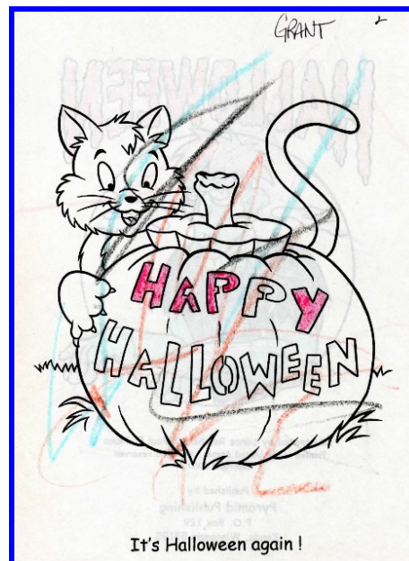
Grant Age 1