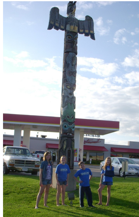
Members pose with a totem pole and discuss what symbols would best suit each other if a totem pole was made to represent them.